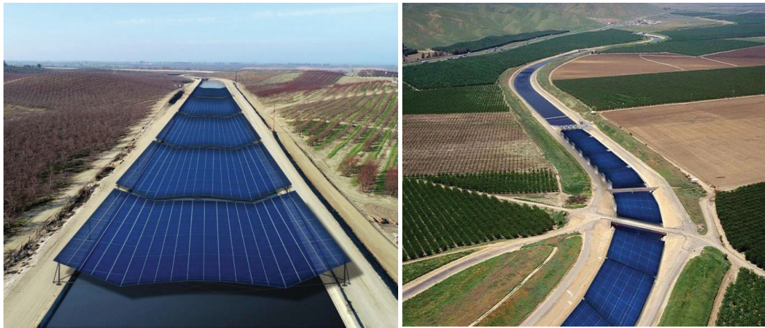
Figure 1: Schematic of Canal top Solar plant with 2 types, Canal top more expensive and floating with 90% of market share.

to 90%, improves water quality, and supports marine life.